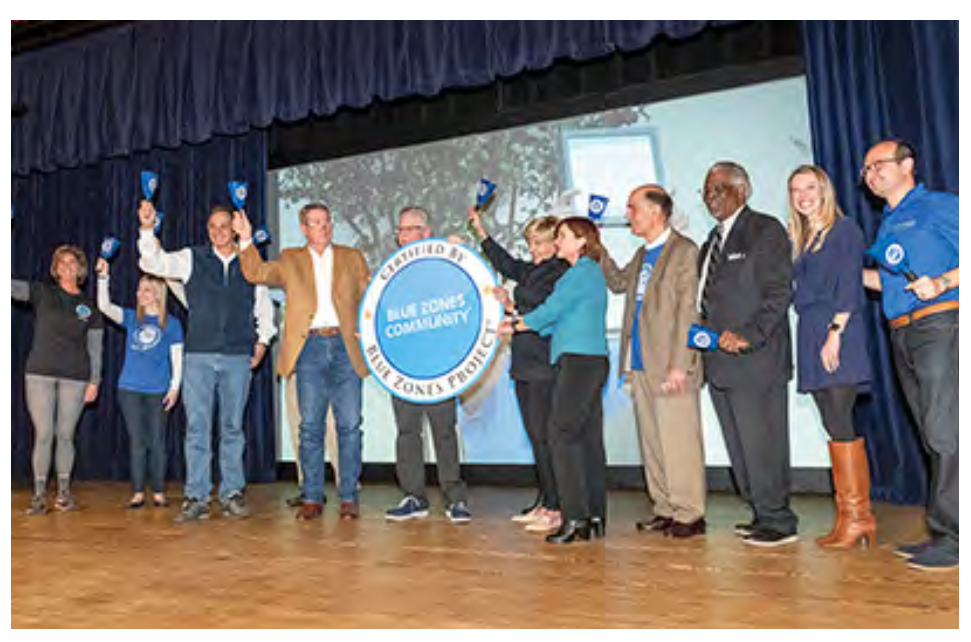
Ringing the bell to officially certify Fort Worth as a Blue Zones Community at a celebration on November 10 at Will Rogers Memorial Center

According to a recent report from Gallup, Fort Worth has achieved a new record in overall well-being with a 2018 Well-Being Index score of 62.5. This score is nearly four points higher than the city's score in 2014 and also surpassed the 2018 U.S. Well-Being Index score of 61.3. Compared with approximately 190 metro areas nationally, Fort Worth rose from a rank of 185 in 2014 to 58th last year.