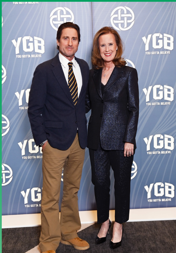
We were pleased to have Luke Wilson join us at the 2024 Donor Appreciation Dinner.