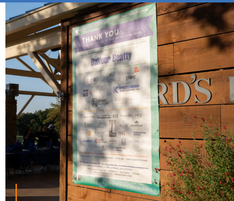
We couldn't have this tournament without the generous support of our sponsors!